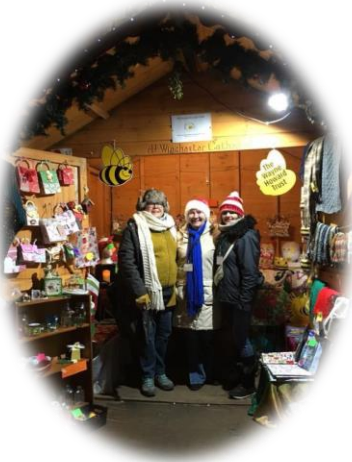
←Charity Stall at Winchester Christmas Market 2017.