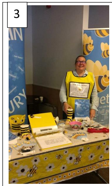
1. Raising awareness during Brain Injury Week 2018, 2. ABICA Plus 3. ABICA Plus raising awareness at TARGET for medical professionals Southampton