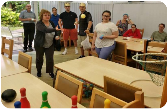
Various Drop-in activities including indoor sports day, crafts, and a drum rumble 2017/18