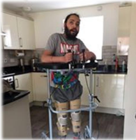
Client with a walking frame we purchased 2017